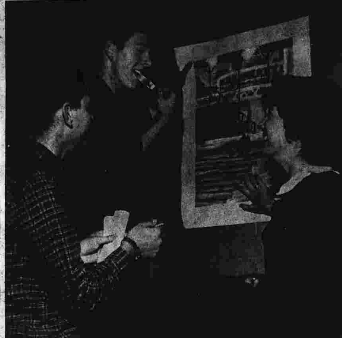
Manchester teen-agers put finishing touches on the new teen center, located in rooms of the old technical school on School St., in preparation for opening tomorrow night with a dance.

The Manchester teen center will open this weekend with a dance tomorrow at 7 p.m. for members and an open house Sunday from 4 to 7 p.m. for parents.