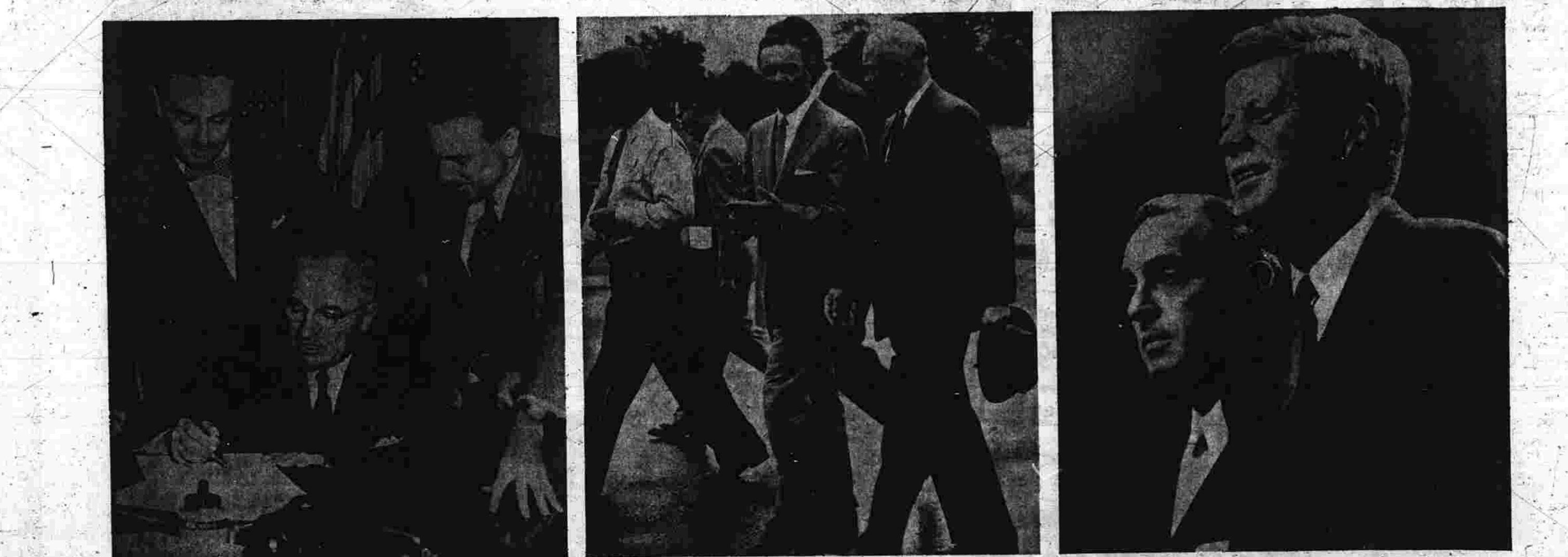
IN CONGRESS Here with President Truman are Abe Ribicoff and the late Sen. Dan Rostenkowski.

"There is a time for everything..." This is a time for leadership