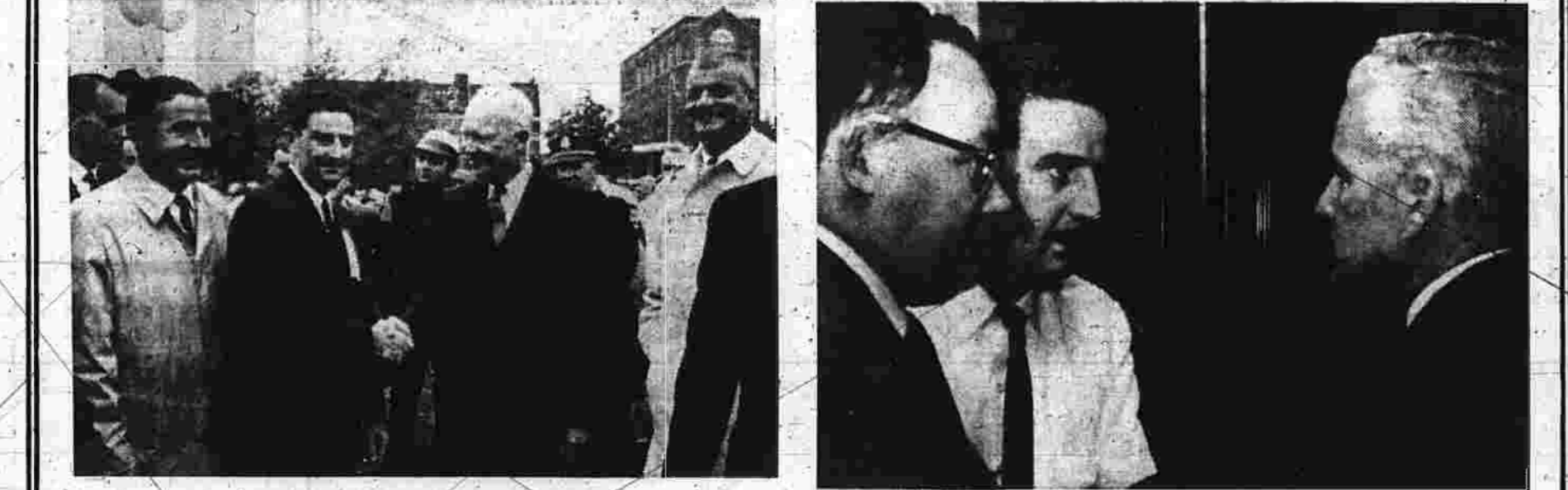
GREETING EISENHOWER WITH ALSOP and SEELY-BROWN A KEY FIGURE AT THE REPUBLICAN STATE CONVENTION